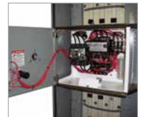
Square D replacement MCC unit installed in General Electric 7700 Series structure

For both the direct replacement and retrofill modernization solutions, new cubicle doors are provided to match the existing equipment and new circuit breaker face.