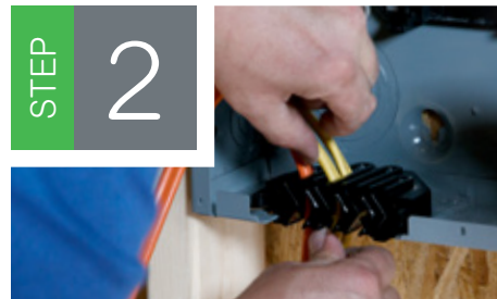
Slide the wire into the slot