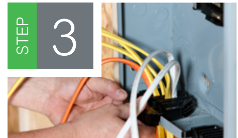
Snap on the Qwik-Grip shield when all circuits are installed