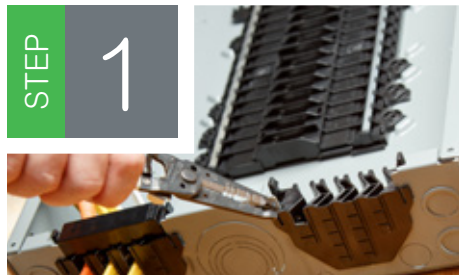
Remove the needed Qwiklet tabs