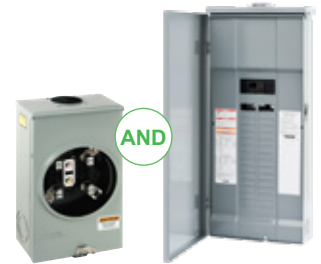
Meter socket Outside MB load center Outside