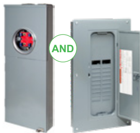
Meter main Outside MLO load center Inside