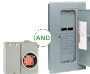
Meter main Outside MLO load center Inside