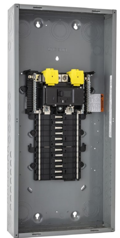
QO circuit breaker