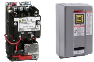
Open and enclosed NEMA non-combination starter