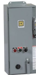
Pre-configured NEMA combination starter