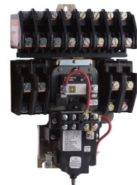
Open lighting contactor