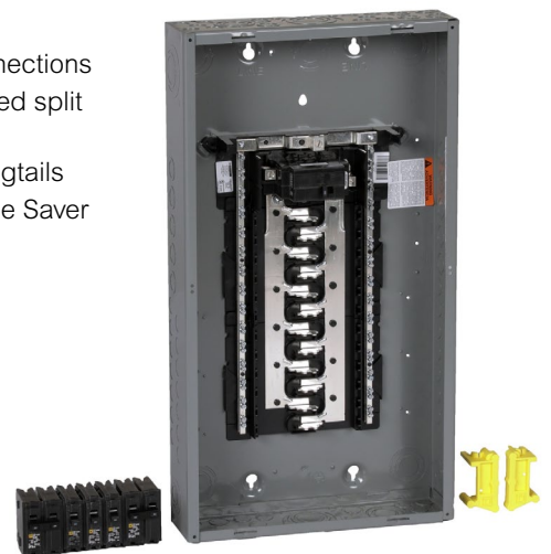
Homeline circuit breakers

Inspect load centers and circuit breakers