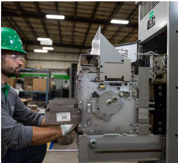
Equipment is de-energized