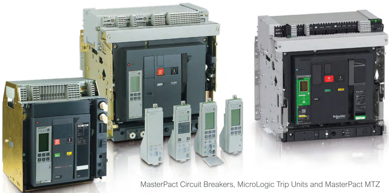
MasterPact Circuit Breakers, MicroLogic Trip Units and MasterPact MTZ